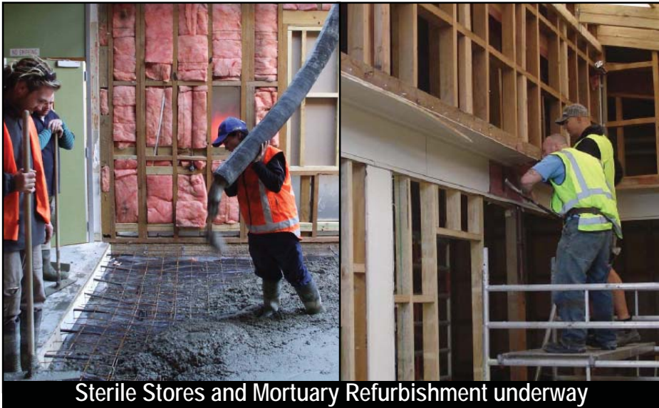
Sterile Stores and Mortuary Refurbishment underway