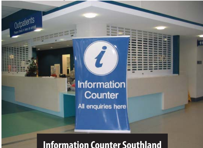
Information Counter Southland Hospital