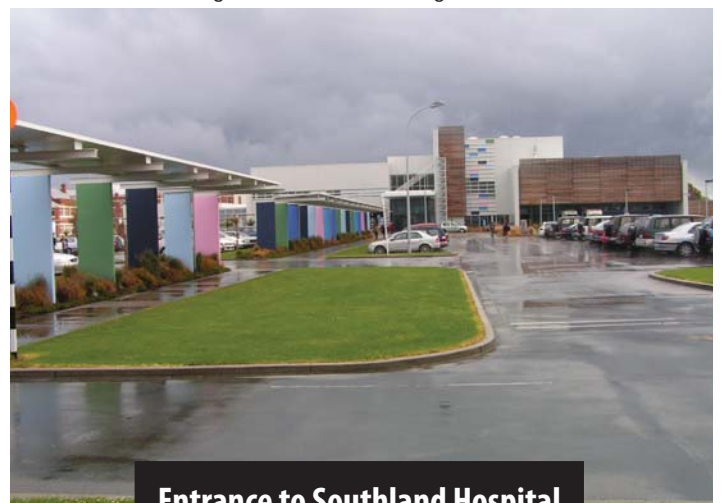
Entrance to Southland Hospital

As more user groups Model's of Care progress, there will be further site visits organised in the coming weeks.