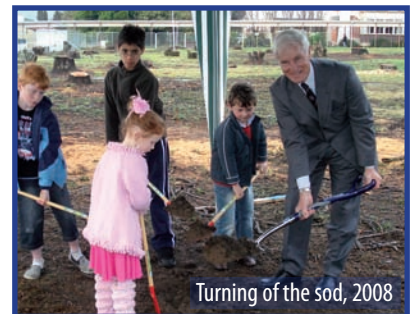
Turning of the sod, 2008