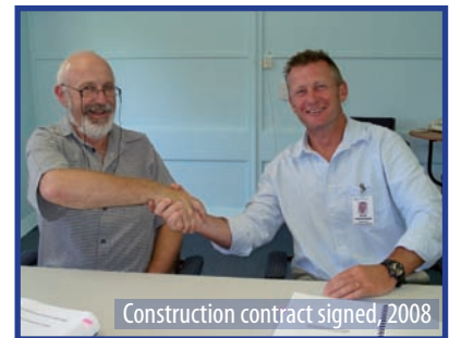
Construction contract signed, 2008