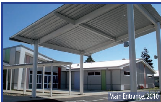
Main Entrance, 2010