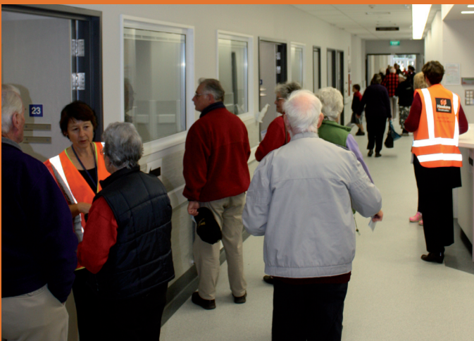
Visitors walk the corridors during the Stage One preview in May 2009

The preview is self-guided and can be completed at visitors' own pace. Last entry will be at 5.45pm.