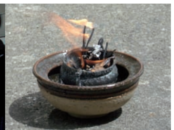
Kaumatua Graeme Grennell burnt a small section of the Clinical Services block during the decommissioning ceremony