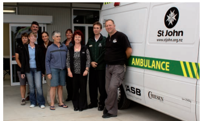
The St John team came down to join in the preview and demonstrated a transfer from the ambulance into the new ED

Not all of the 370 people who flocked to the preview afternoon on Wednesday, 10 February 2010 recognised the Arthur Wicks building that previously housed the surgical ward; however all gave their unreserved approval of the new-look Emergency Department, High Dependency Unit and Acute Assessment Unit.