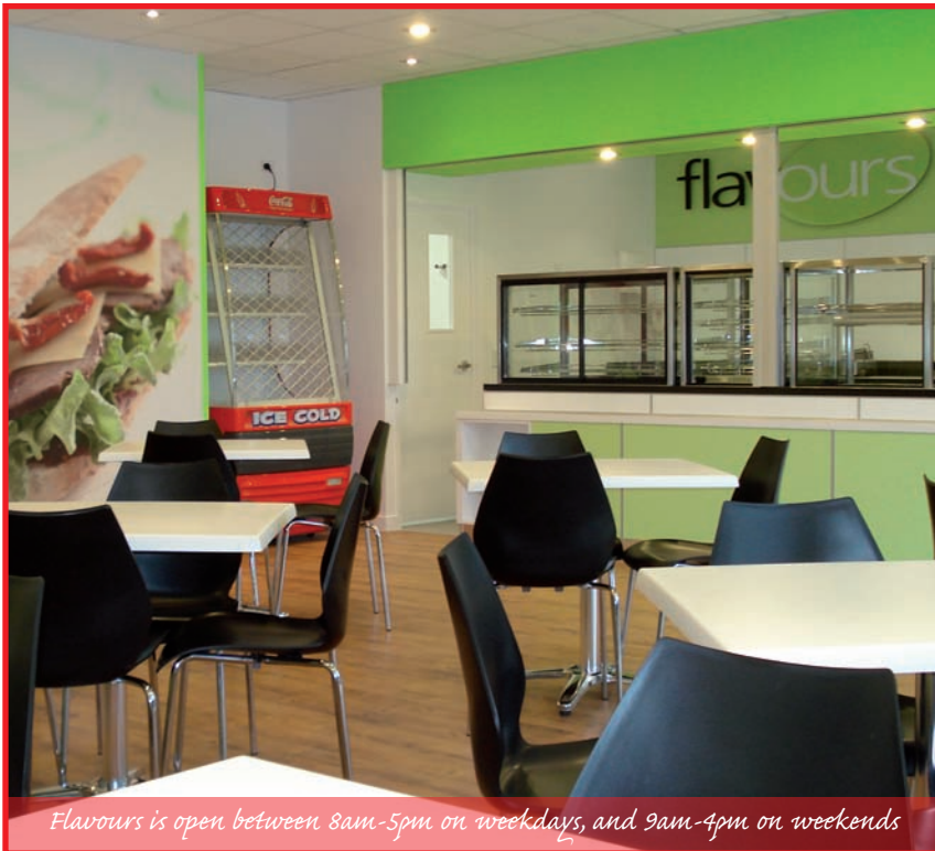
Flavours is open between 8am-5pm on weekdays, and 9am-4pm on weekends