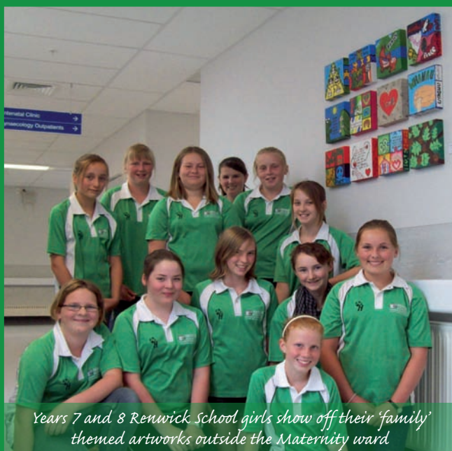
Years 7 and 8 Renwick School girls show off their 'family' themed artworks outside the Maternity ward

Inspired by a 'My Family' theme, the students have decorated twelve 20cm x 20cm canvas blocks which were generously provided by Warehouse Stationary.