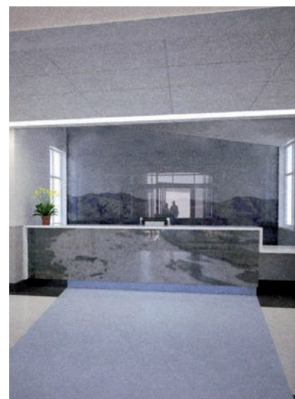
Artist's impression of the interior of the planned Main Entrance; glass art will adorn the wall behind the counter.

Representatives of the group will be available to speak to interested members of the community at the Emergency Department open afternoon on 10 February 2010.