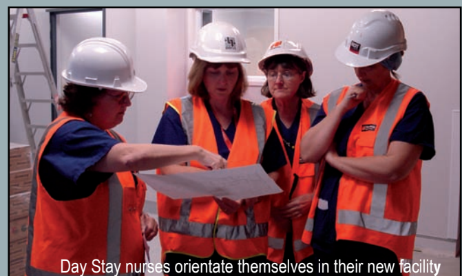
Day Stay nurses orientate themselves in their new facility

Site visits to the new Stage Three facilities have commenced for staff working in Outpatients, Day Stay Unit, Maternity and Paediatrics. Comments from the first visit included surprise and delight at the generous size of the Inpatient rooms in Maternity and the consultation spaces in Outpatients. Day Stay Unit staff enjoyed walking through their "fresh and neat" department after months of looking at the plans on paper. They are pleased with their "lovely" blue colour scheme and large storage cupboards.