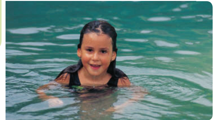
Time to float